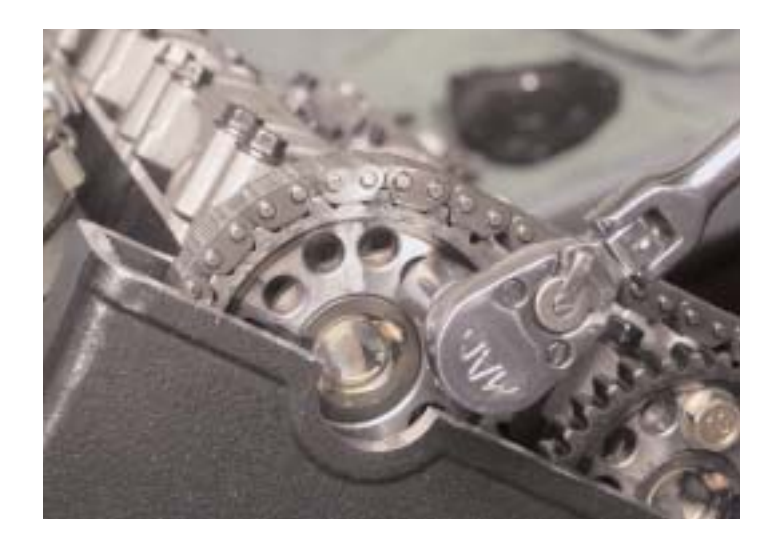
To alter the cam lobe's center, you need to loosen the sprocket bolts and move the crankshaft slightly.

valves will open BBDC and close ATDC. (Note: Some mechanics will turn the engine backward to measure the point where the valve is 1.5 mm from closed, then turn the crank forward until the valve is at the 1-mm testing height. By turning the engine backward, you must account for any possible free play in the timing chain or you'll risk incorrect readings.)