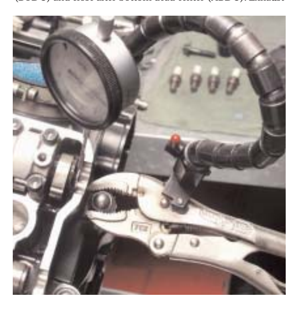
The dial indicator needs to be solidly mounted to the engine. Make sure that the plunger moves parallel to the valve and has enough range to track the valve through its maximum extension.

rotate the crankshaft forward. You will need to count the number of times that the indicator's needle circles the gauge before reversing direction as the valve starts to close. Count down the same number of turns on the indicator until the closing height is at 1 mm. Write down this number. Give the numbers a logic check to make sure that what you've recorded makes sense. An intake valve will open before top dead center (BTDC) and close after bottom dead center (ABDC). Exhaust